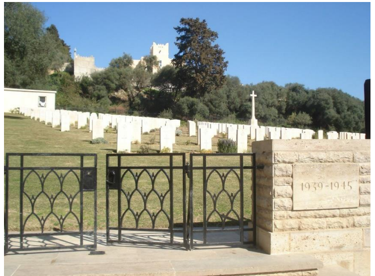
Dely Ibrahim War Cemetery, Algeria